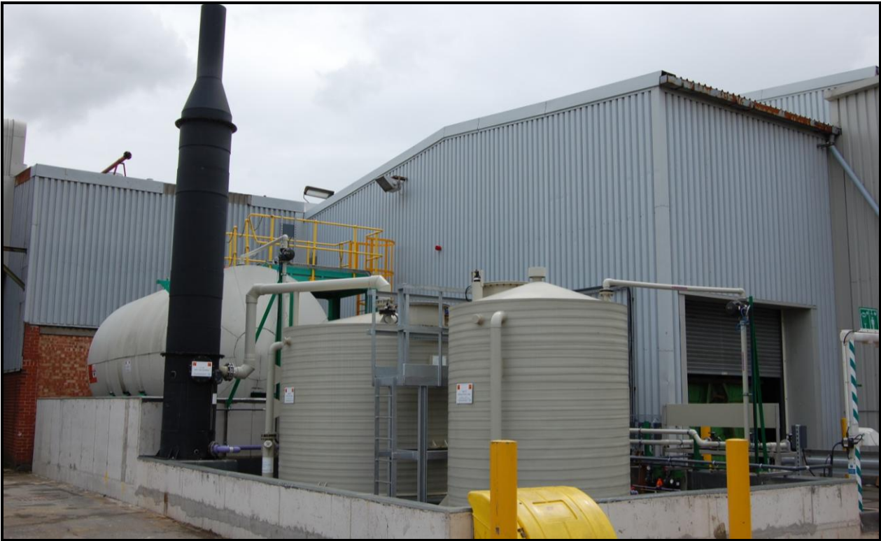
Bulk Chemical Storage Tanks