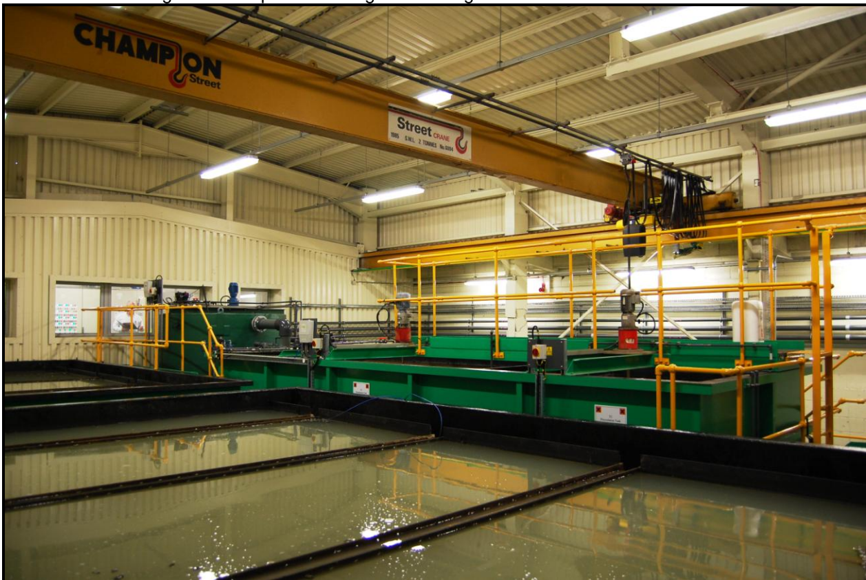
Treatment and Settlement Tanks