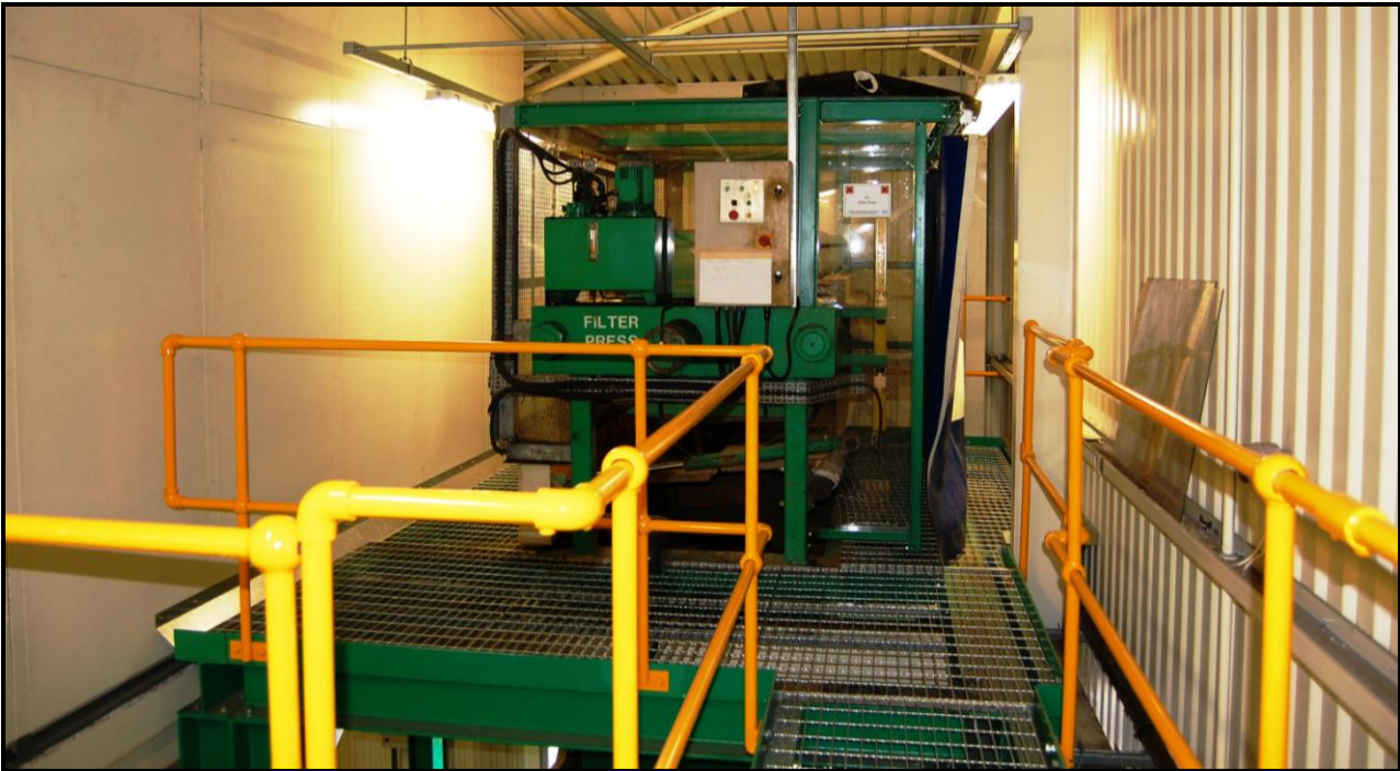
Fully Automatic Filter Press for Sludge Dewatering

Since commissioning and handover, the treatment plant has consistently produced a discharge quality well within the requirements of the Consent conditions from the Environment Agency which are shown in the table below: